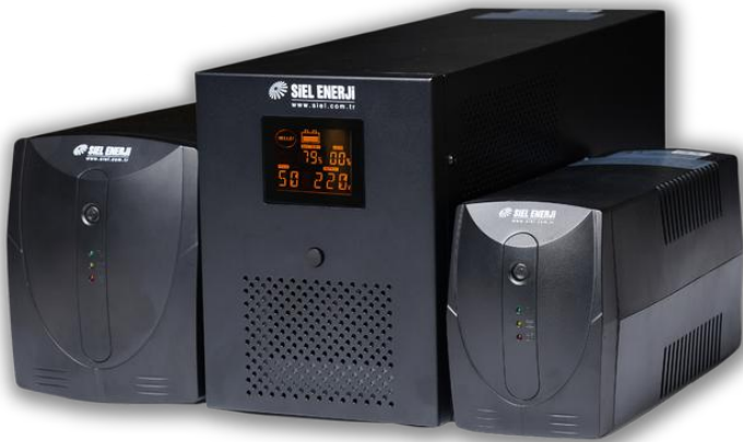
*Product images may vary according to power values.